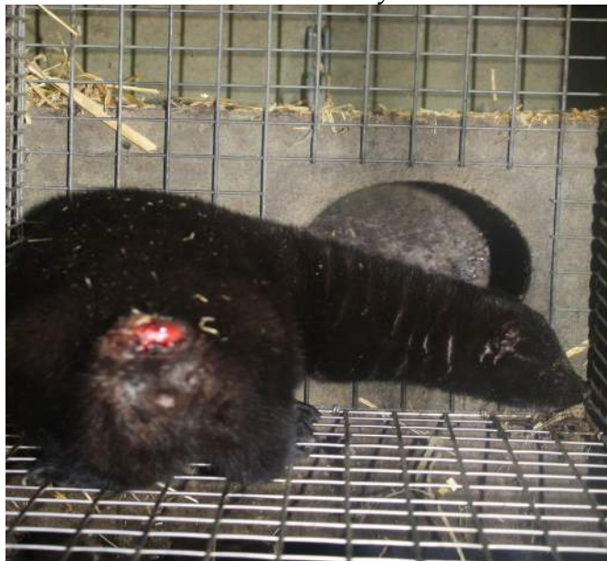
Norka bez ogona i z raną na fermie w Chodzieży

welfare problem and have a negative impact on the environment nearby.